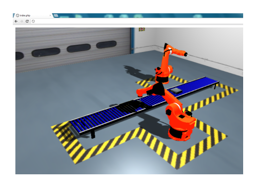
Figure 1: Web3D industrial application.

Considering these requirements, this work analyses two of the most extended web3D platforms, O3D [O3D ] and X3DOM [X3DOM ].