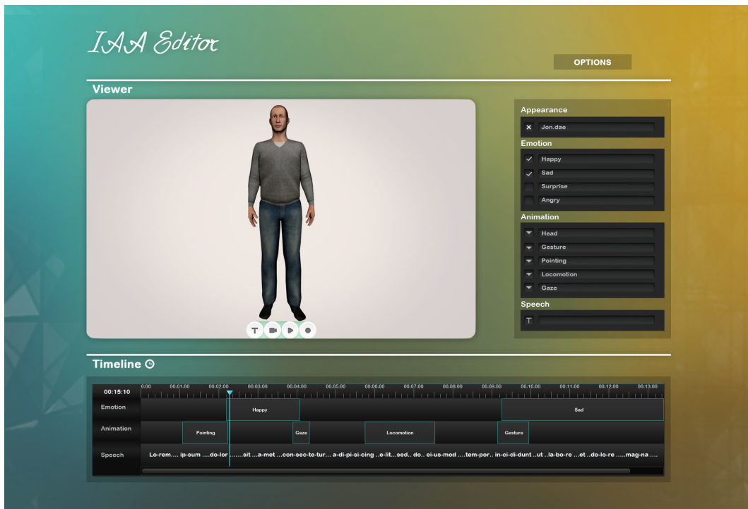
Figure 2: Intelligent Animated Agent Editor.