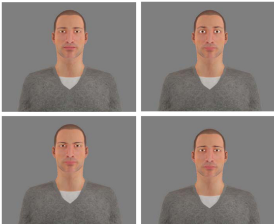
Figure 1: IAAAN represented as a 3D virtual agent expressing facial emotions (happiness, surprise, anger, sadness).

With respect to facial expression, the IAA editor is based on Ekman's six universal emotions (Ekman and Friesen, 1981), so IAAAN will be able to show the following facial expressions: happiness, surprise, anger, sadness, disgust and fear. An example of IAAAN performing these facial expressions can be found in Figure 1.