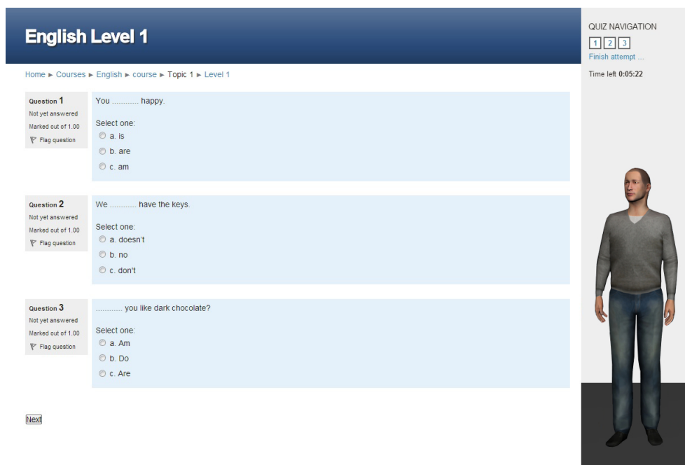
Figure 5: Integration of IAA into Moodle.