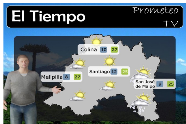
Figure 3. Platform produced weather report.

About the metadata aggregation, the platform makes even easier the use of templates and databases. Access to a database via the web platform makes it more intuitive for inexperienced users. User can provide human understandable meteorological concepts that would be translated to real time acquired atmospheric measures. This way the user just has to provide a geographic context to establish the database PK. After selecting this information, the system automatically creates the queries for the database so that the user does not have to worry about anything. In addition to manually creation of videos, it has proven the periodic creation of videos in an automatic manner.