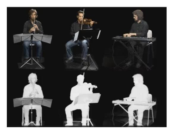
Figure 5: Video with mask sent via streaming.